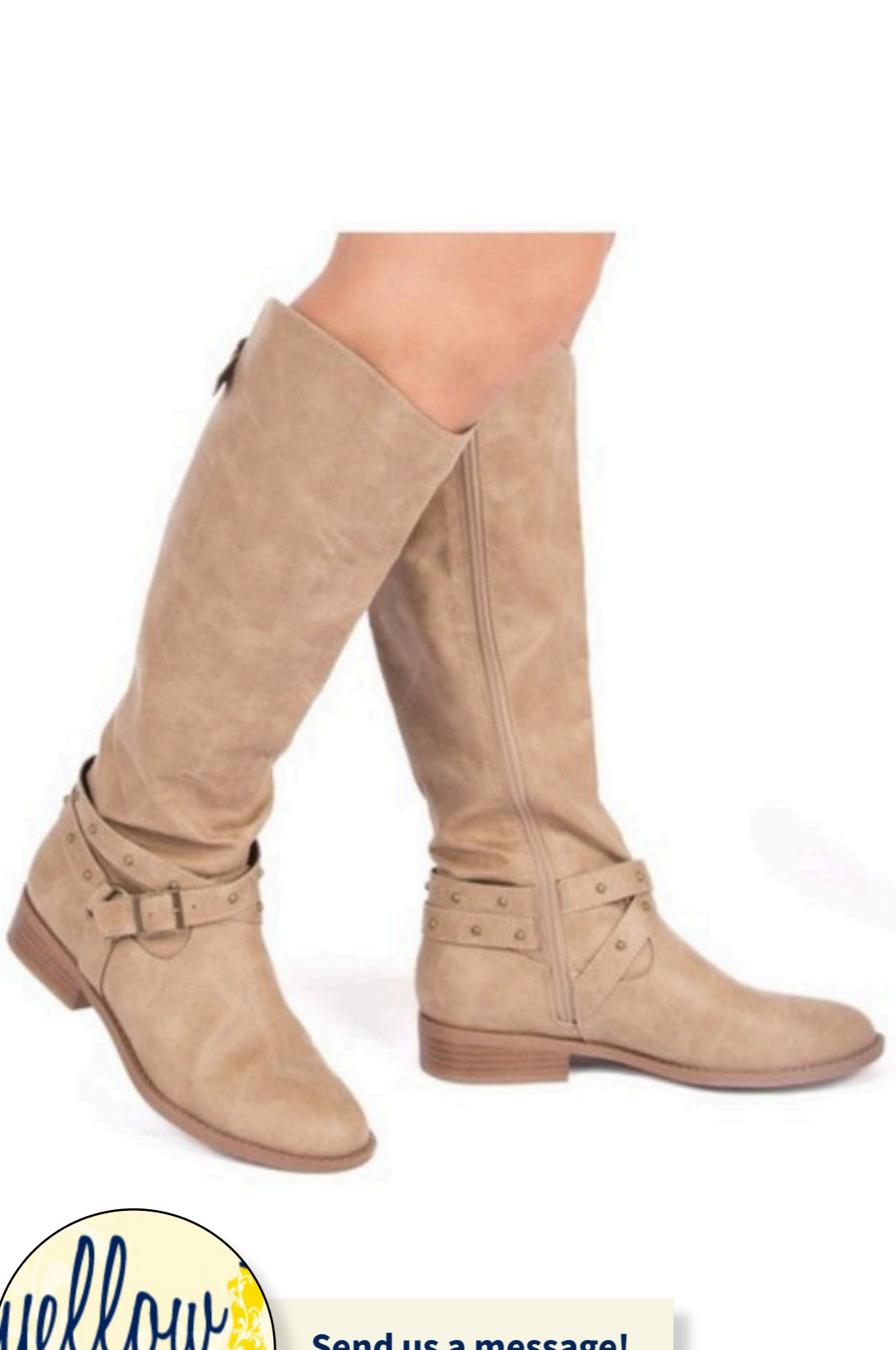
Send us a message! Riding Boots -Beige