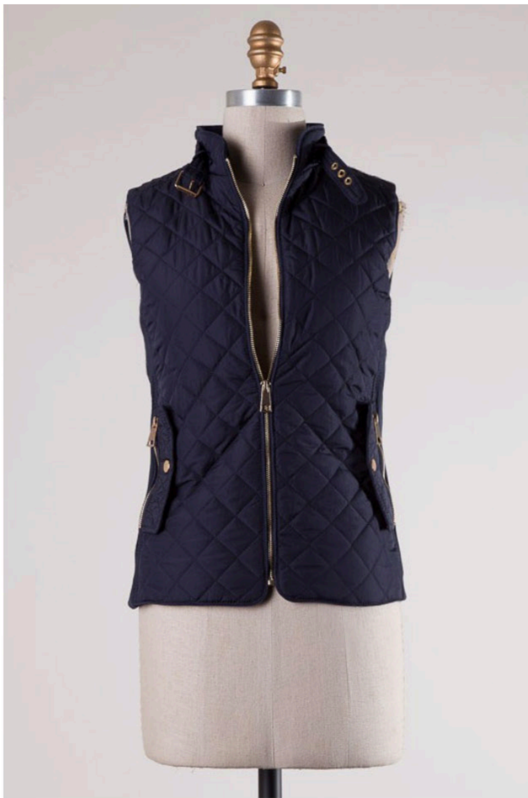
Outlander Vest -Navy $58.00