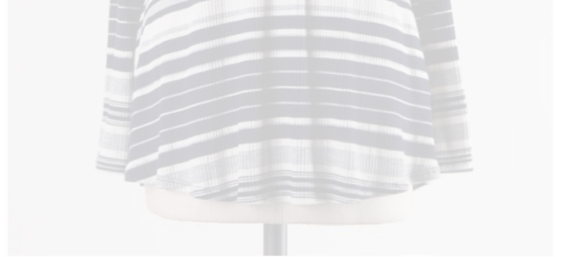
Isla Side Button Cowl Neck Top $48.00