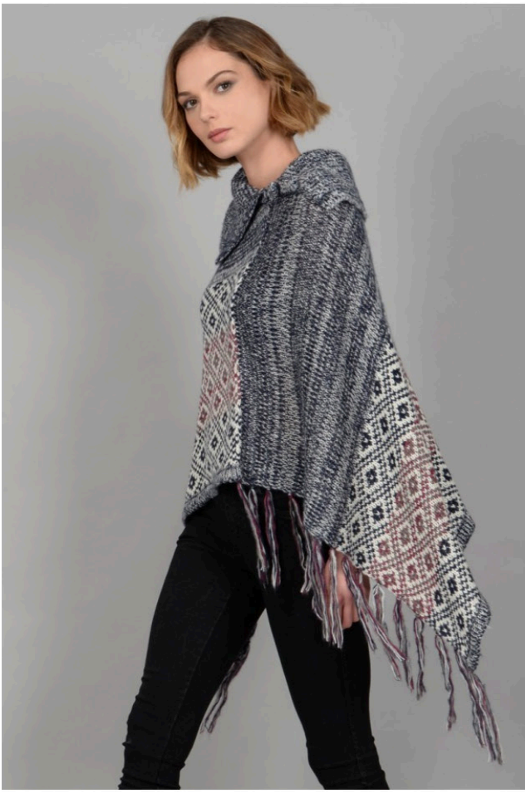
Ladies Knitted Poncho $78.00