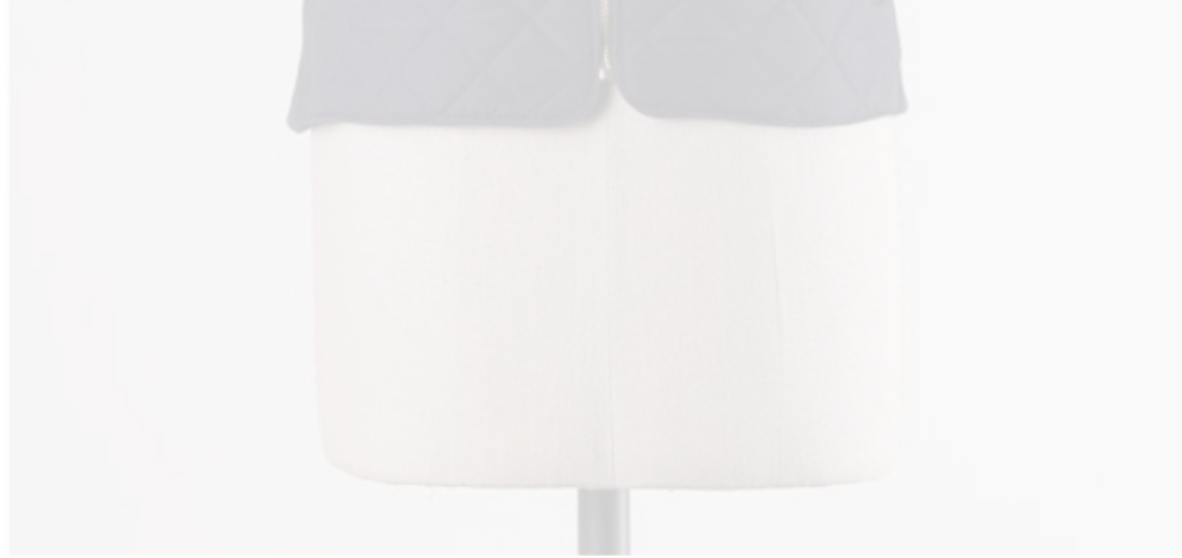
Outlander Vest -Navy $58.00