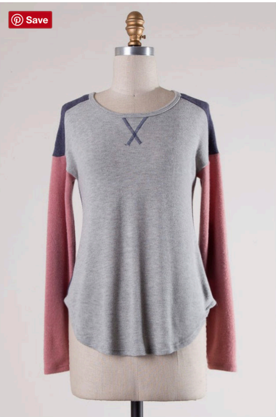
Fraser Elbow Patch Knit Top $48.00