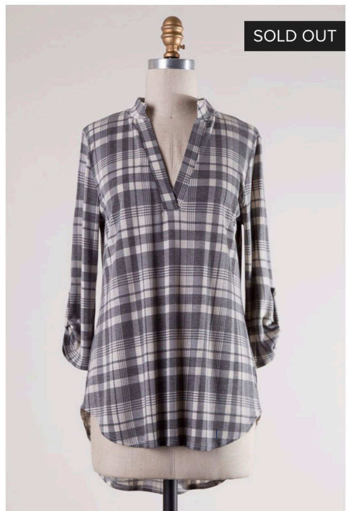
Gordon Plaid High Low Blouse