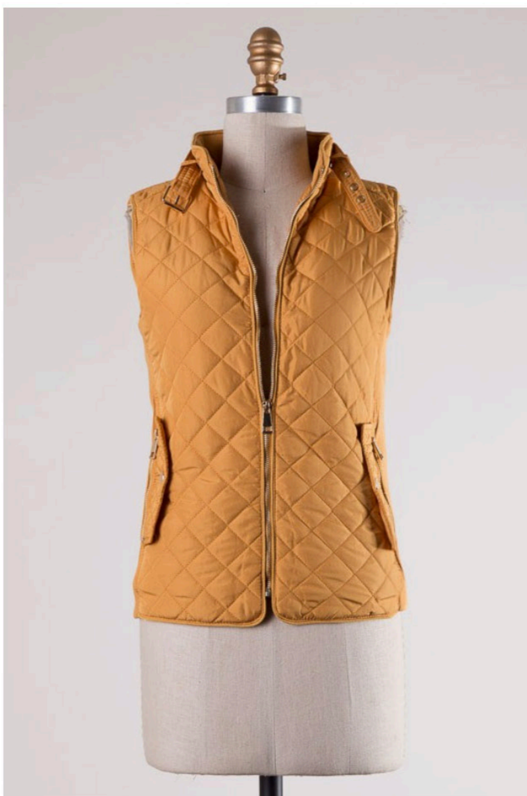
Outlander Vest -Mustard