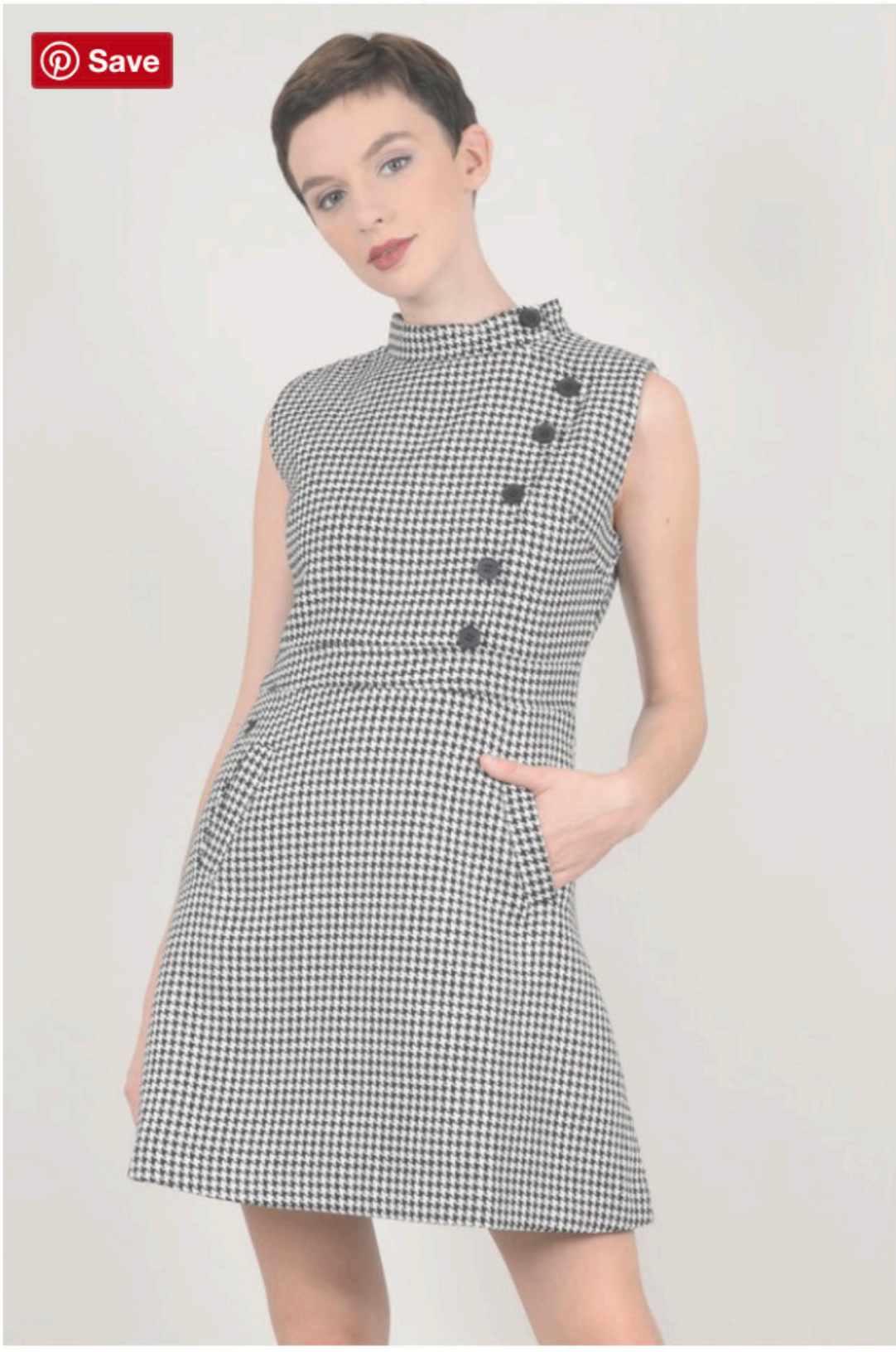
Beatha Check Dress $96.00