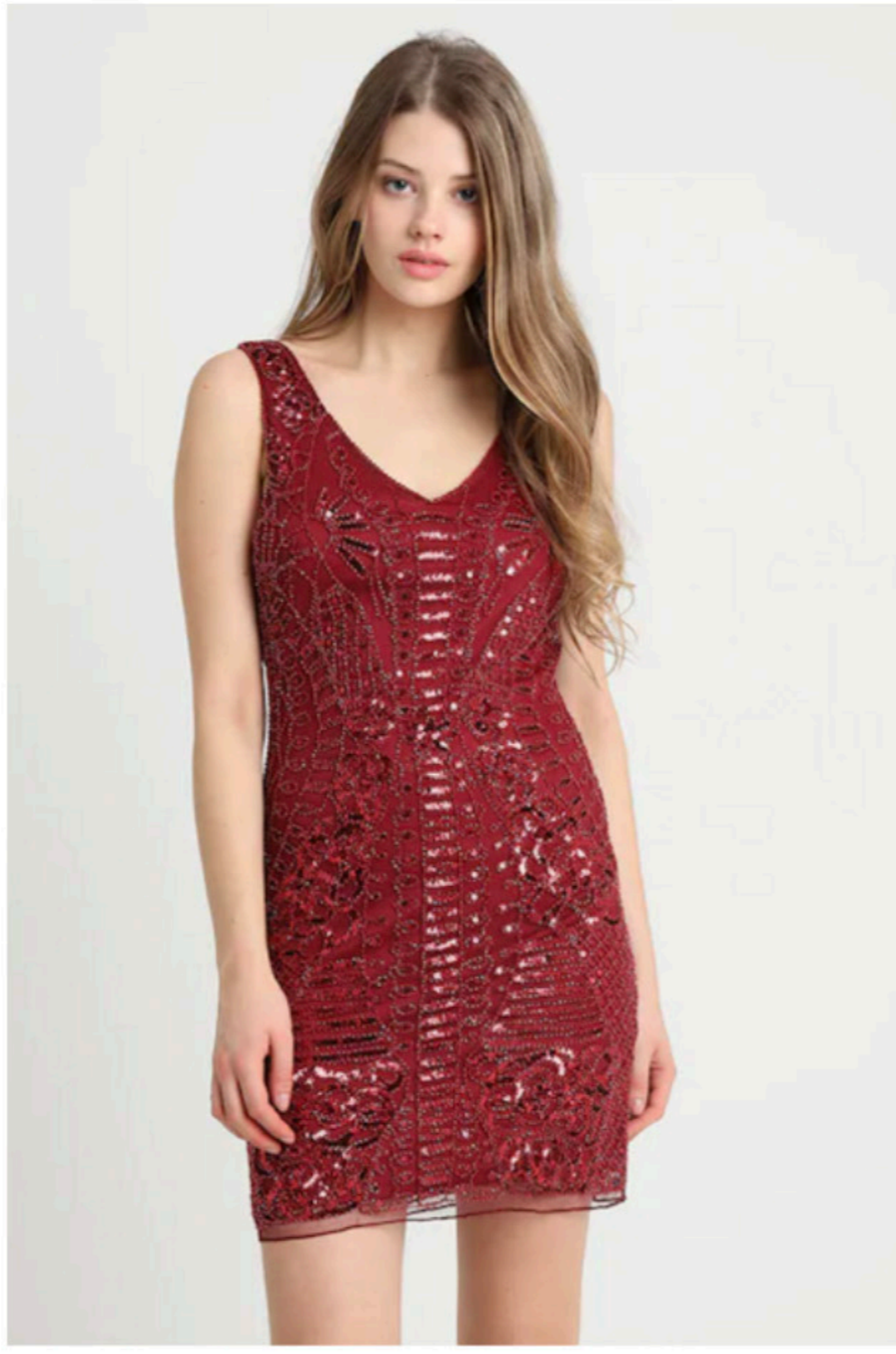
Burgundy Cocktail Dress $88.00