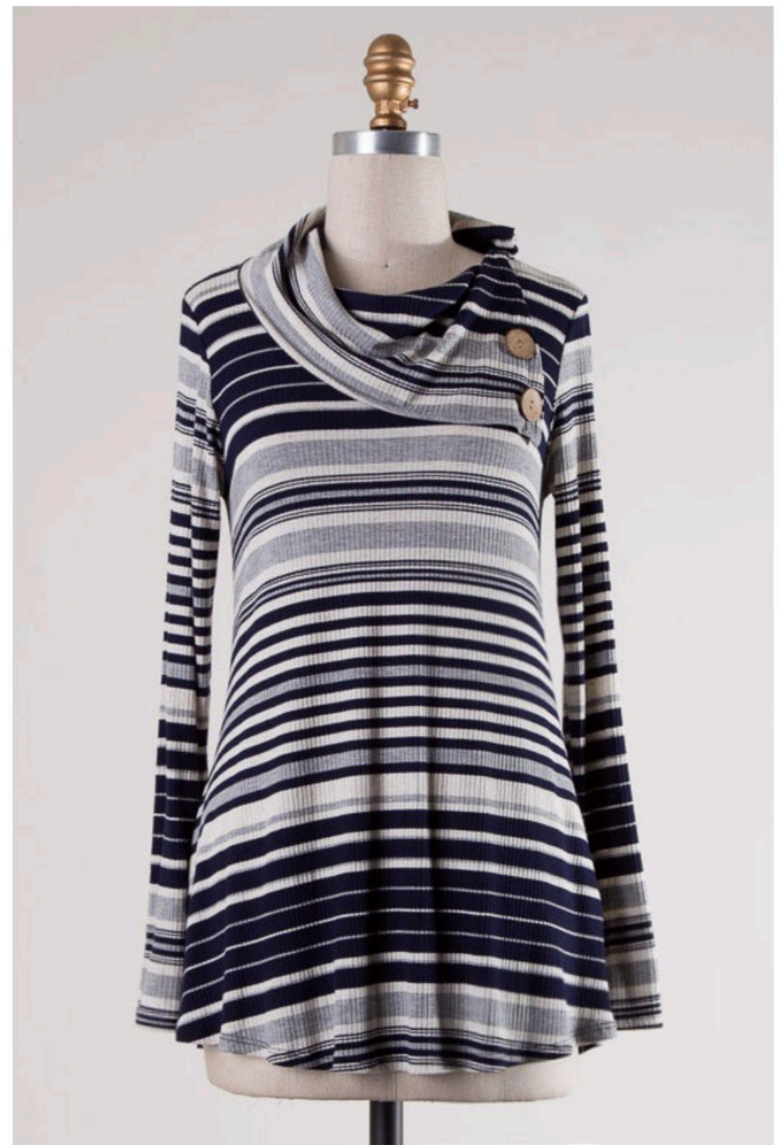
Isla Side Button Cowl Neck Top $48.00