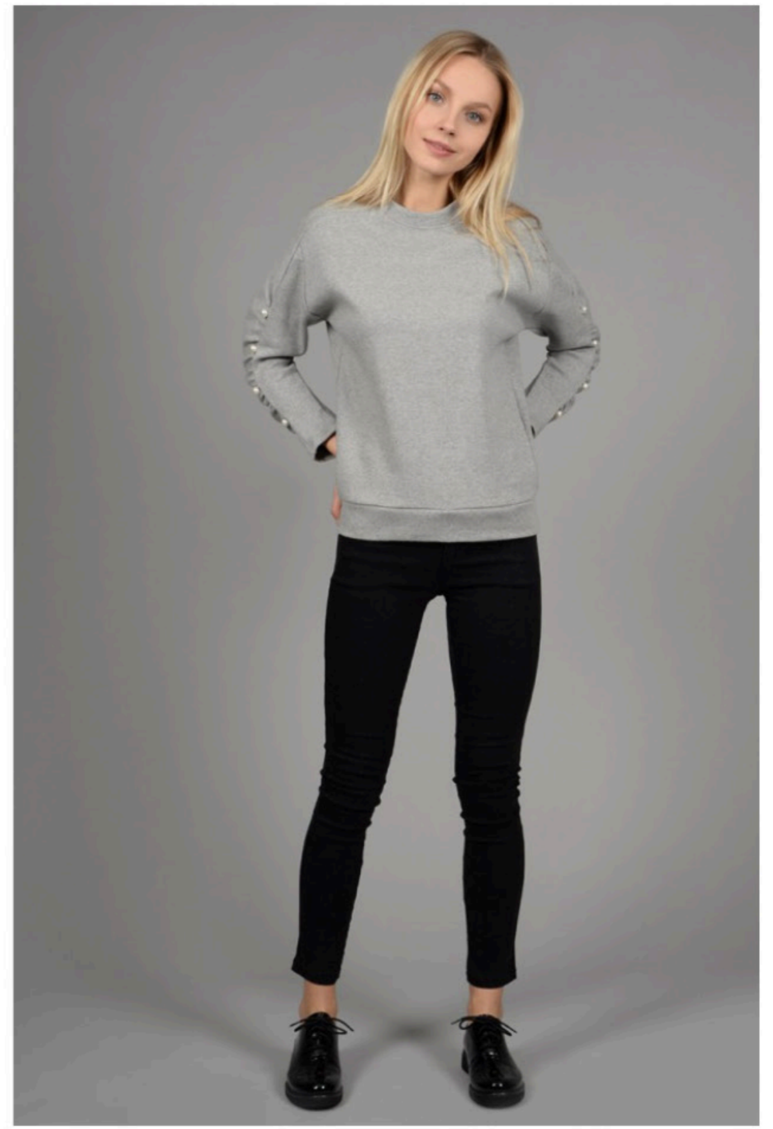
Grey Knit Pearl Sweatshirt $59.00