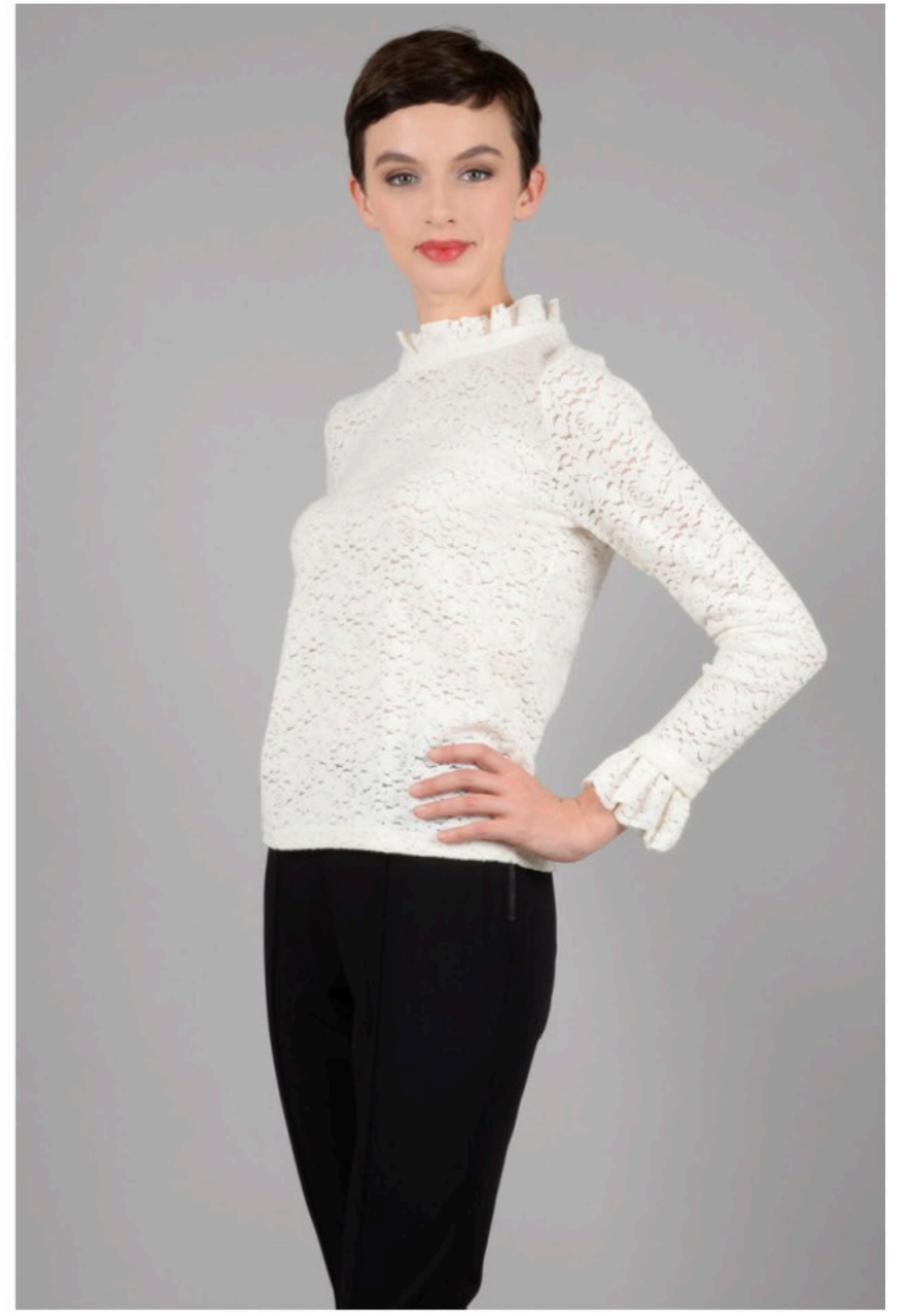
Parisian Lace Sweater $59.00